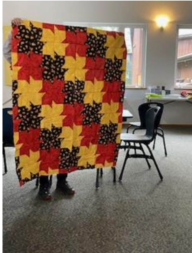
Sandi Benzel shared two quilts that she made for a good friend using different patterns and poppy fabric.