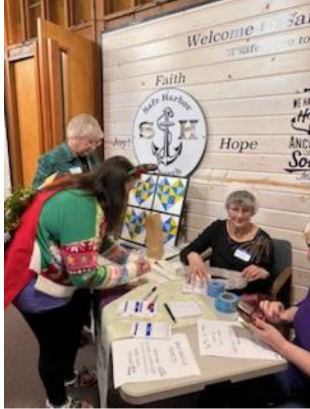
Buying tickets for raffles