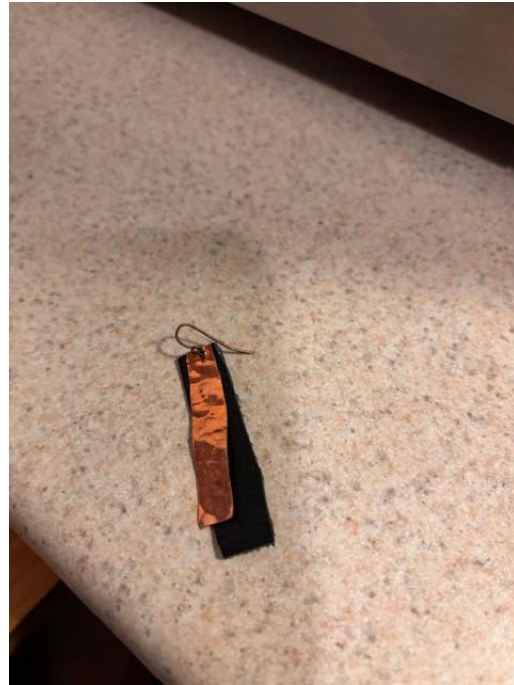
Item #2 with a lost owner