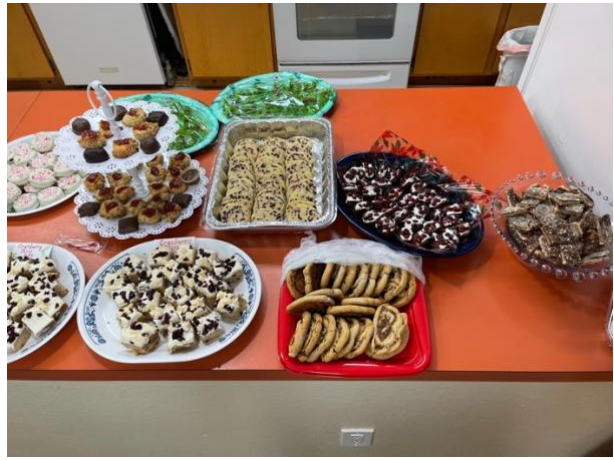
The food is always plentiful and delicious! Thank you to everyone who brought something.