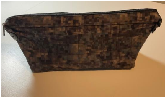
Sandra Bleicher's bag