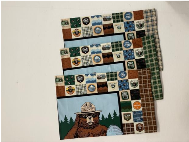
Dixie made pillowcases for a set of triplets in Idaho.