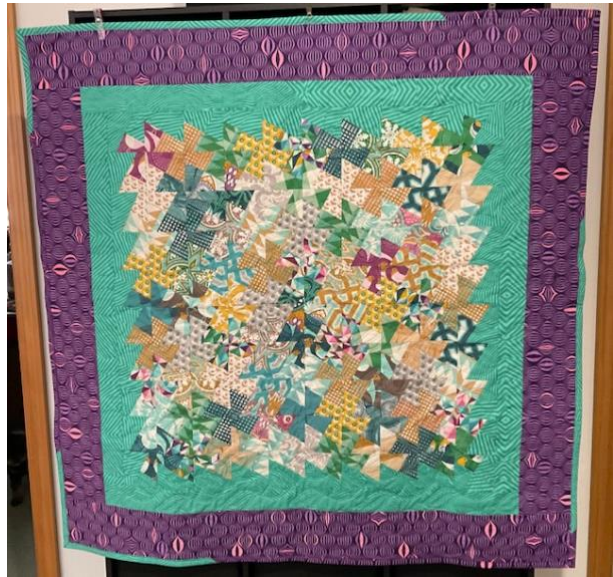
Judy Morley delivered the following six quilts to Oncology on January 10, 2025: