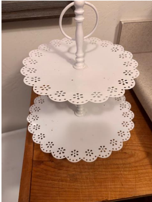
Item #1 with a lost owner